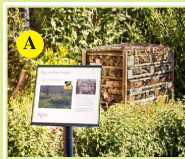
Area A: Naturalised bulbs woodland planting, nectar plants and scrub